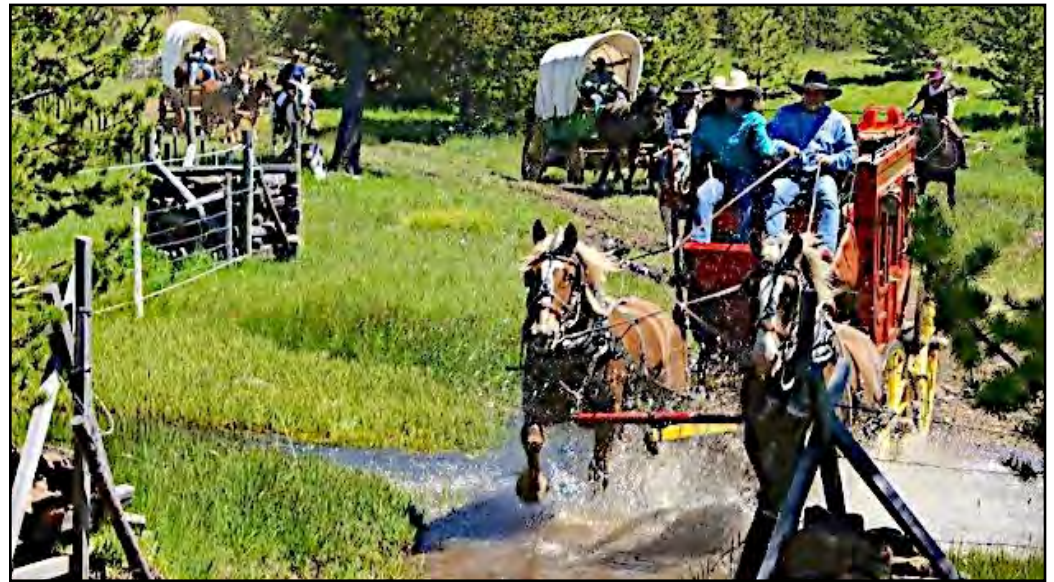
Wagons Ho! —The stagecoach takes a water crossing as the Pendleton Round-up Wagon Train moves out through the Blue Mountains west of Ukiah. Now in its 33rd year, the Wagon Train includes 12 to 14 wagons and more than 100 horseback riders.